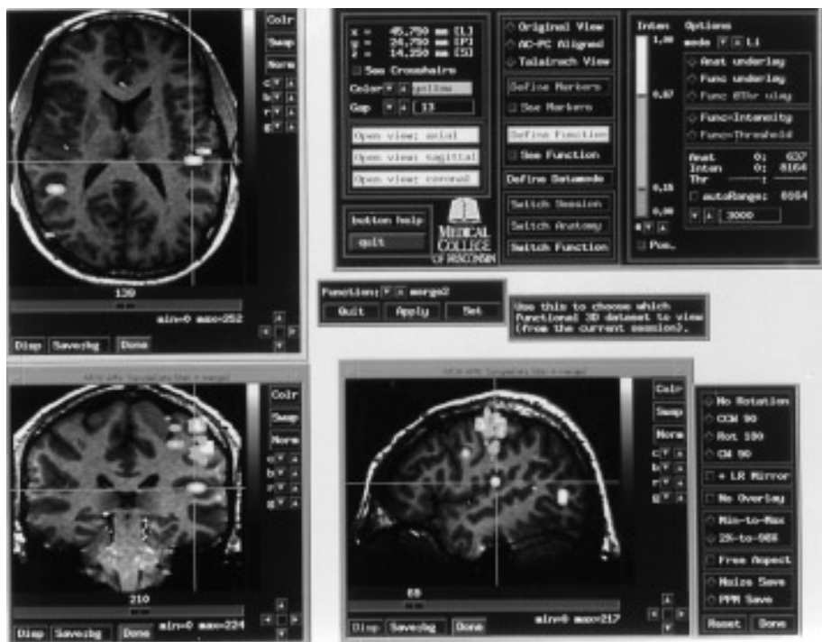
FIG. 3. Screen snapshot from an AFNI session, showing the main control panel and the slice image viewing windows.